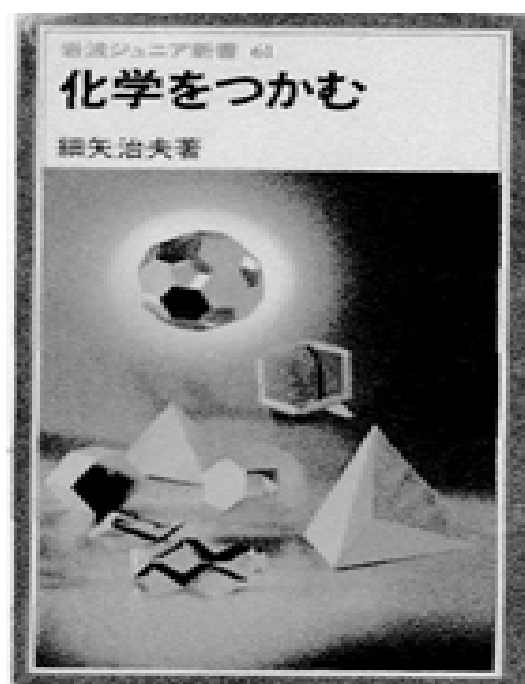
Figure 4. Cover of "To Grasp Chemistry".

into a number of smaller feasible subgraphs by using ad hoc giant recursion formulas. After filling up a whole big notebook I could obtain the final result, but I had no confidence in my result, except for the highly factorable last term, or perfect matching number, of 12500 = 2^2 \times 5^5 . What a beautiful result it was. Then I submitted my paper "Matching and Symmetry of Graphs" to Computers and Mathematics with Applications as I was invited by Hargittai to contribute to its special issue [23]. It was published in 1986, and was adopted into a book "Symmetry Unifying Human Understanding" [12].