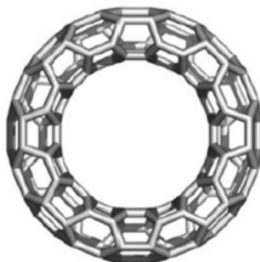
Figure 1. A toroidal fullerene (or achiral polyhex nanotorus) T[p, q] .

A nanostructure is an object of intermediate size between molecular and microscopic structures. It is a product derived through engineering at the molecular scale. In what follows we aim to apply Corollary 2.5 to the molecular graph of a nanostructure called toroidal fullerenes (or achiral polyhex nanotorus) (see Figure 1 and Figure 2).